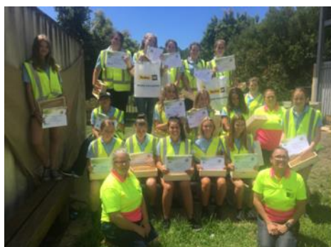
Group Shot of all girls at the end of a hard day's work as a tradie.