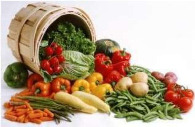
An image of sustainable food. (Sustainability, 2015)